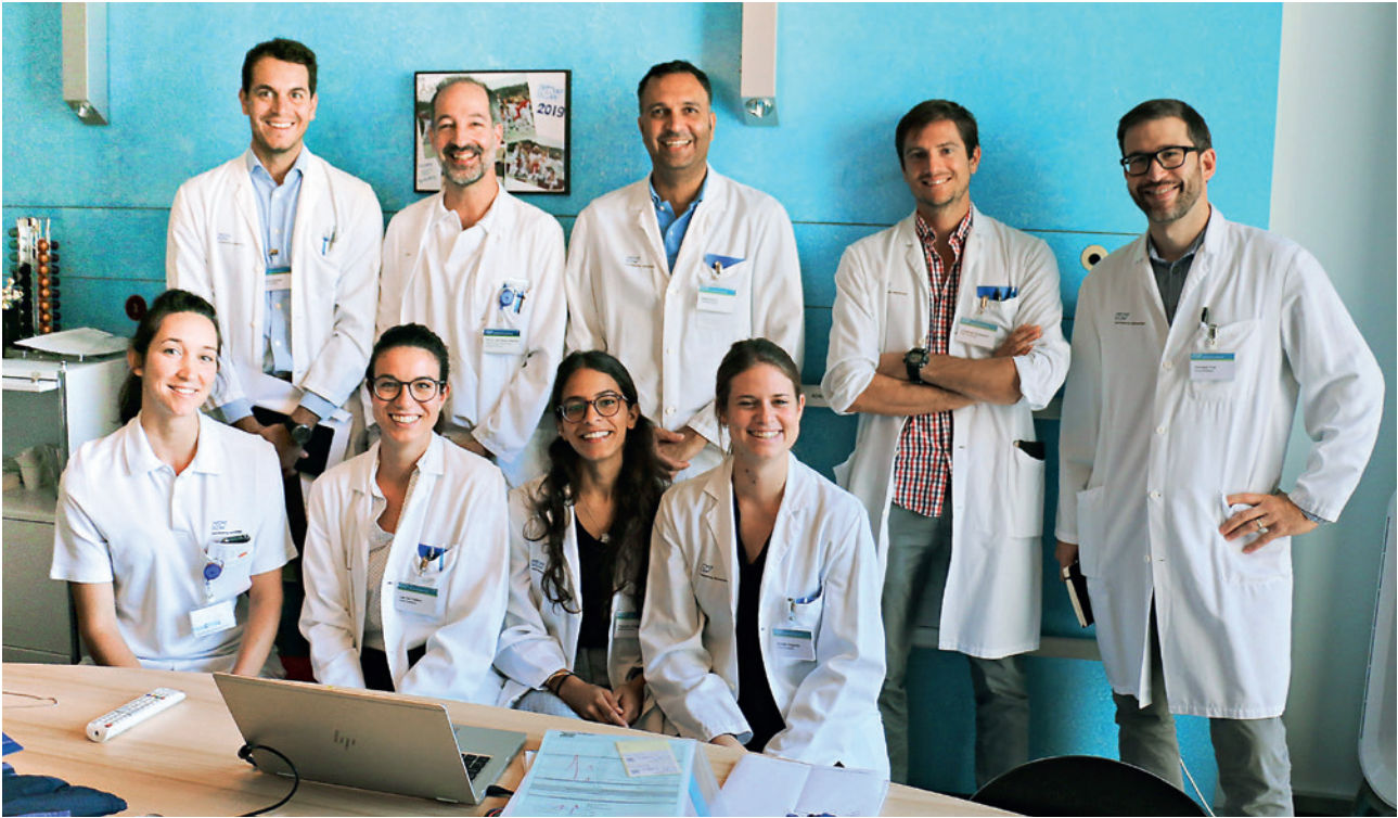
Clinical Immersion 2019