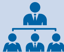
Better career opportunities