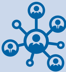
An expanding network

With your newly acquired expertise, you will benefit from better career opportunities. What's more, you will be able to continually expand your network, enjoy professional redevelopment, and learn to appreciate the many benefits of lifelong learning.