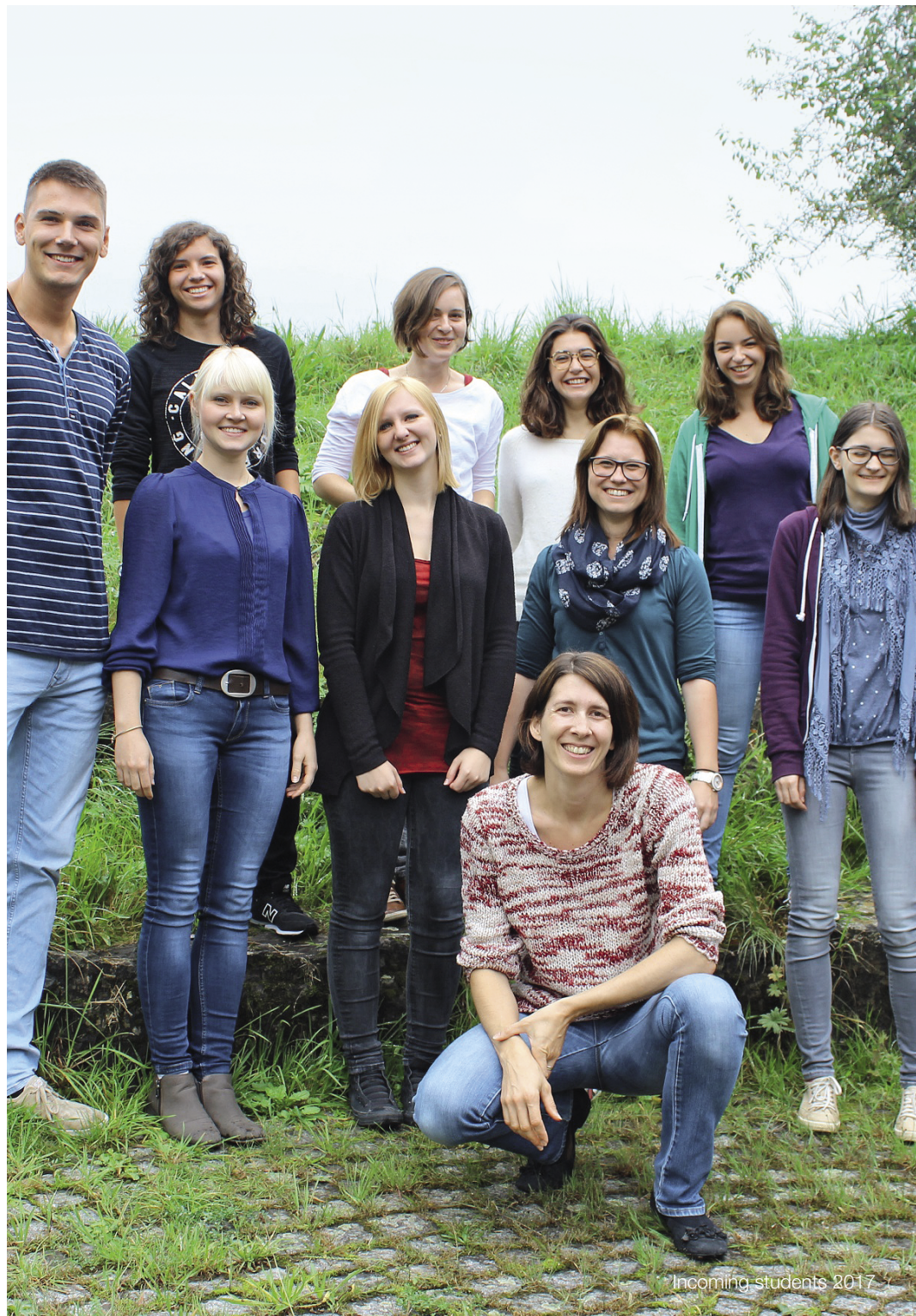
Incoming students 2017