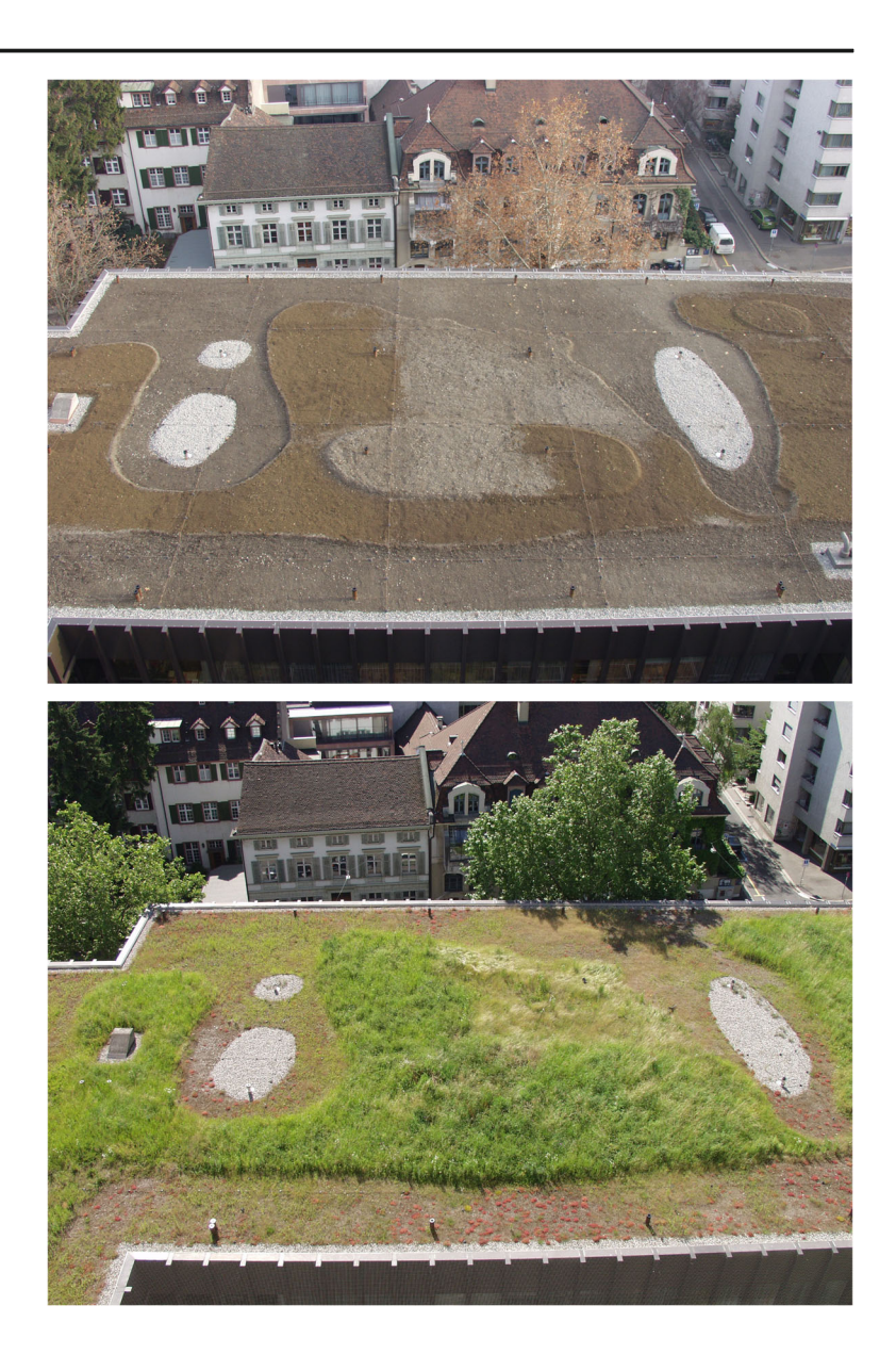
Fig. 3 Green roof of the University Hospital Basel, Klinikum 2. The pictures show the different substrate types used, such as sandy, slightly-loamy gravel and top soil in different thicknesses (8, 15 and 20 cm), in line with mandatory guidelines for the city of Basel. The picture on the left was taken just after installation in 2003 and on the right after three vegetation periods in June 2006. This green roof had very high carabid species richness (> 20 species), most likely occurring because of the variation of microhabitats and the use of natural soil

emphasize the value of green roofs for their diversity in terms of vegetation, substrate composition and structure. Finally, this study identifies two characterization criteria that may be used in the evaluation of roofs, with no particular priority between the two: i) roofs with dominant and frequent species that are important to maintain viable and functional populations/communities in densely urbanised areas (which may be due to suitable local habitat conditions but also well-connected urban landscape surroundings); ii) roofs with rare, endangered and stenotopic species that contribute in a particular way to the meta-population dynamics of such species.