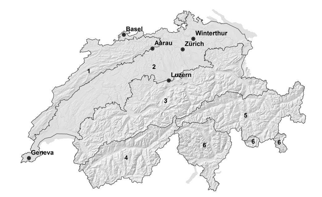
Fig. 1 Localization of the sampled cities (black dots) in Switzerland. Biogeographic regions according to Gonseth et al. (2001) are indicated with numbers (1 = Jura, 2 = Plateau, 3 = Northern foothills of the Alps, 4 = Western Central Alps, 5 = Southern foothills of the Alps, 6 = Easter Central Alps)

Ground beetle communities were characterised based on (i) demographic parameters, such as dominance (dominant and subdominant species) and frequency (on roofs) of the different species within the communities, (ii) degree of threat (based on the RL), and (iii) the ecological