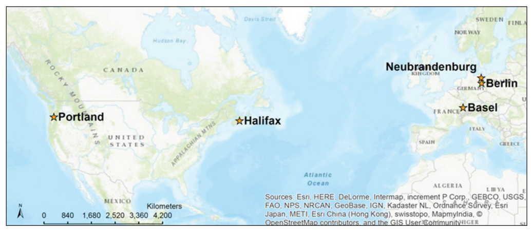
Figure 1. Map showing location of our study sites.

We assembled data on beetle species diversity and abundance from 2 cities in North America (Halifax, NS, Canada; Portland, OR, USA) and 3 cities in Europe (Basel, Switzerland; Neubrandenburg, Germany; and Berlin, Germany; Fig. 1). A summary of the different studies compared in the present paper are provided in Table 1. In all 5 cities, beetles were collected using pitfall traps. We categorized roofs as intensive if they were over 20 cm in depth, extensive if they were under 20 cm in depth, and as extensive-varied if they were purposely designed with varied substrate-depth but where depth was \leq 20 cm in all areas. Data from Portland (PDX) are from a 2014 (March–September) survey that included 8 roofs: 1 intensive, 2 extensive-varied, and 5 extensive roofs. Data from Halifax (HAL) came from a 2009 (May-October) study of 5 intensive roofs (MacIvor and Lundholm 2011). Our species lists from Berlin (BER), and Neubrandenburg (NEU), Germany are described in a separate article in this special issue (Ksiazek-Mikenas et al. 2018). Beetles were collected over 1 field season (April–September) in 2013 at 8 roofs in BER and 5 roofs in NEU; these roofs were all classified as extensive. Data from Basel (BSL) came from a 2013 (March-September) collection from 15 roofs: 6 extensive-varied and 9 extensive.