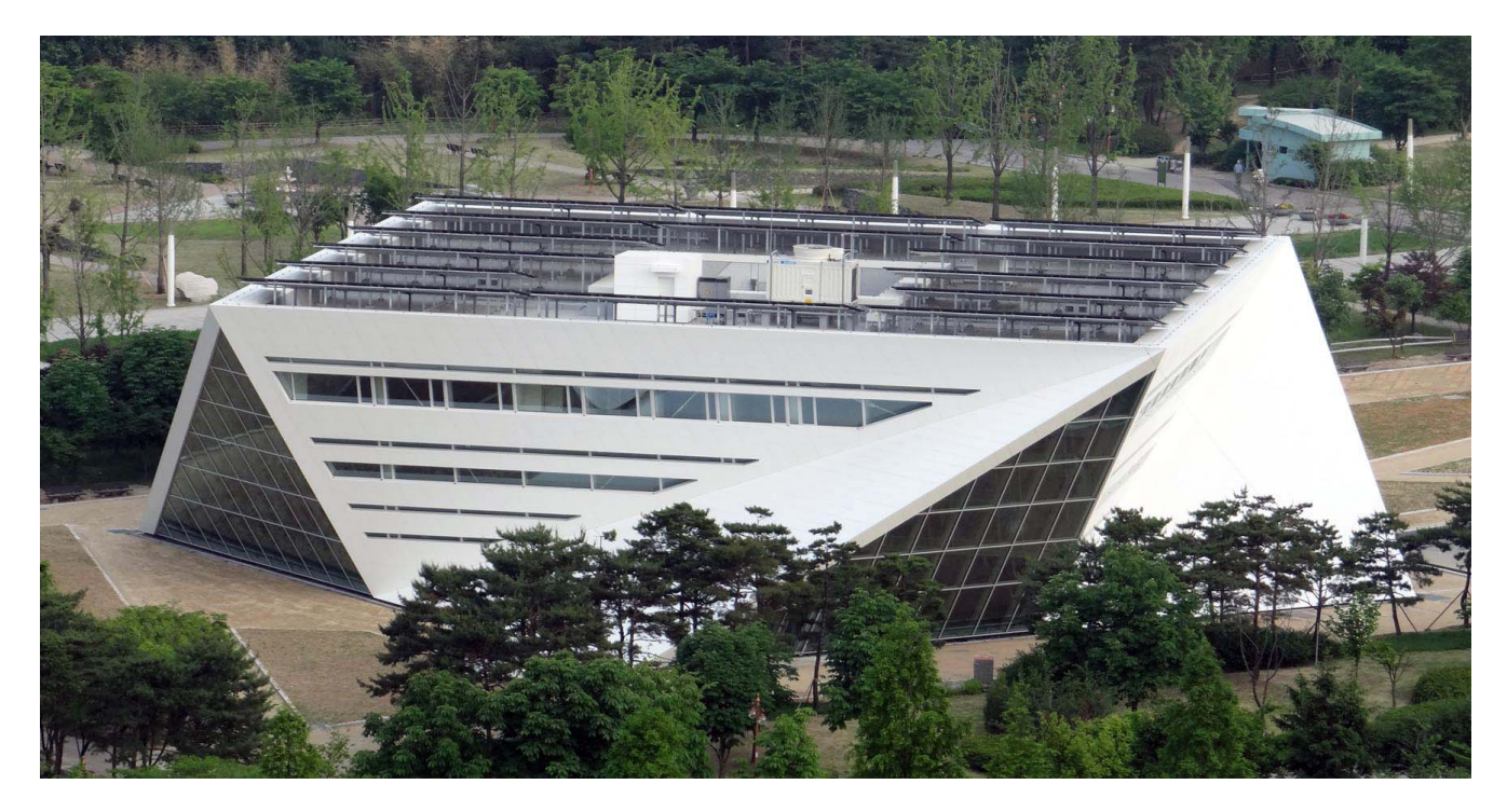
Figure 2. Additional construction features of elevated, but formally integrated PV installation with mono-crystalline cell technologies on the roof of the "Energy Dream Center" in Seoul, South Korea.

Architecture and civil engineering determine the creative, design and construction concepts of building integrated PV components, whereas the photovoltaic use determines the energy concepts. Electricity production from sunlight is an additional function, which, on account of the specific appearance of different PV technologies, can offer complementary possibilities for creativity in architecture. Integrated photovoltaic construction elements, which differ retrospectively from fitted elevated installations, are also an element of creativity for façades and roofs. Accordingly, from an architectural point of view, a seamless, technically designed integration of PV components into buildings also results in a formally creative integration (Figure 3). In contrast, the primary and exclusive function of additionally integrated PV modules is the production of electricity from sunlight, with the aim of gaining the highest yield and the associated financial return. This is also reflected in the design and construction concepts of such installations. Here, the seamless, formally creative and additional integration is a challenge, which is seldom adequately solved, in particular, when PV modules are provided without architectural drafts and concepts and installed into existing buildings.