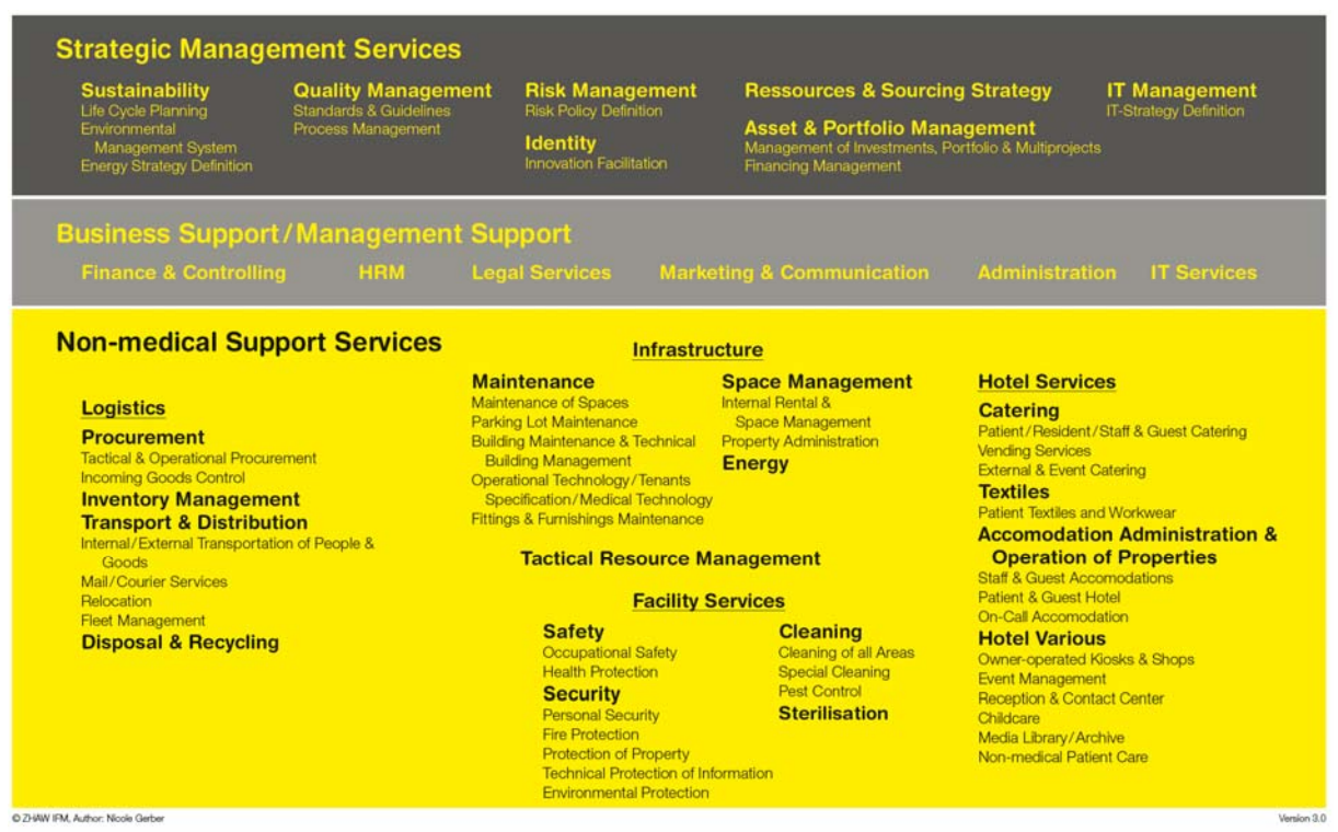
Figure 2: LemoS 3.0 (Gerber, 2016)

After detailed research of the literature, a survey of the use of non-medical software applications in seven hospitals was carried out for empirical data collection. In addition, systematic online searches were conducted.