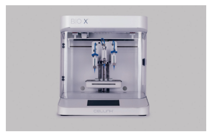
CELLINK's BIO-X, the most user-friendly 3D bioprinter on the market. An advantage is the easy-to-use software, designed to simplify the bioprinting process by guiding the user along every step of the way.

The Sweden-based biotech company develops novel, cellspecific bio-inks for 3D bioprinting of human tissues, such as cartilage, skin and bone. Their benchtop 3D bioprinters are aimed at scientists who want to try out 3D bioprinting and start bioprinting living tissues. The tissue models bioprinted with CELLINK technology are used for 3D culture of human-like tissues, development of in vitro toxicology and cancer models, among other applications. CELLINK created headlines with BIO-X, a device that puts researchers at the cutting edge by being the first bioprinter world-wide with intelligent printheads. BIO-X printheads are characterized by flexibility, beauty and simplicity. "Even if you design your own dispensing technologies, you can use them with the BIO-X system", says Dr Héctor Martinez, co-founder and CTO of CELLINK, underlining the benefits. With the triple printhead technology of BIO-X you can combine different materials and printing techniques to fit your application. You are free to choose from up to 7 different printheads, including a 250°C pneumatic head, a cooled pneumatic head, an ink-jet printhead, a syringe pump printhead and an HD camera tool head. "The possibilities are limitless and give users full freedom to expand their bioprinting research and applications", confirms Dr Héctor Martinez. "BIO-X is the easiest-to-use bioprinter on the market and a complete standalone product."