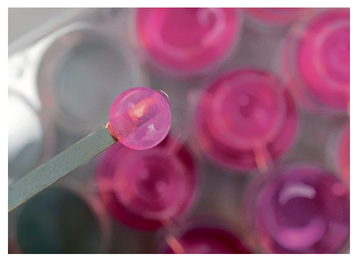
Biogelx hydrogel used in standard cell culture format.