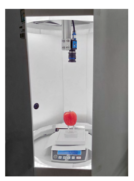
Machine vision system for taking 2D images of apples

The identification of plant species and varieties is crucial for the resilient cultivation and the diversity of crops. Historically, the identification of fruits was carried out by pomologists or, in recent years, also by DNA analysis due to advances in molecular biology. However, both approaches require time, incur costs and are not free from errors. Machine learning methods offer an alternative for the identification of crops varieties. The ShapeScience project is being carried out by a consortium of ZHAW and the SME Realisation Schmid in collaboration with the Federal Office for Agriculture (BLW) and Agroscope/ETH. The aims of the project are to investigate and find biomarkers for the identification of apple varieties based on their fruits to develop a method, and eventually a cognitive system applicable in the field, for automatic fruit variety identification. Additionally, the PhD thesis based on the project, supported by the Institute of Neuroinformatics (UZH/ETH) embraces the investigation of more fundamental questions pertaining to the practical application of neuromorphic technologies for computer vision and autonomous intelligence. \blacksquare