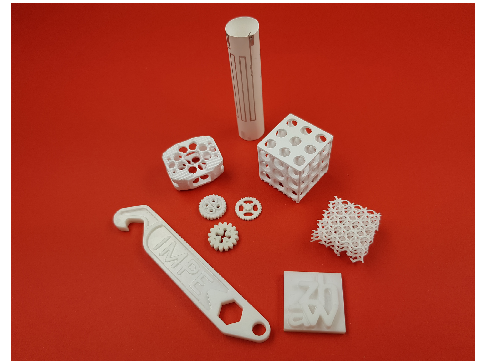
Laboratory samples of advanced ceramics