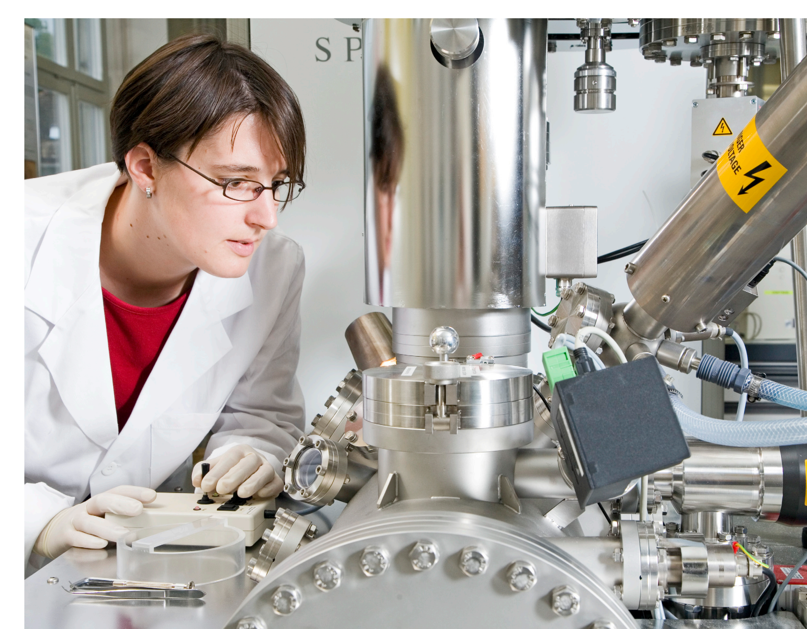
Elemental analysis via XPS