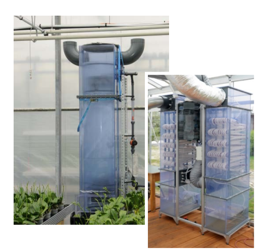
Figure 1: ZHAW and the project partner Watergy test the absorption technology. Left: the absorber installed in the Swiss demonstrator at the greenhouse in Wangen for the air temperature and humidity control (ZHAW). Right: the absorption box of Watergy is installed as air conditioner in a prototype building in Berlin.

ZHAW School of Engineering Technikumstrasse 9 8401 Winterthur info.engineering@zhaw.ch www.engineering.zhaw.ch