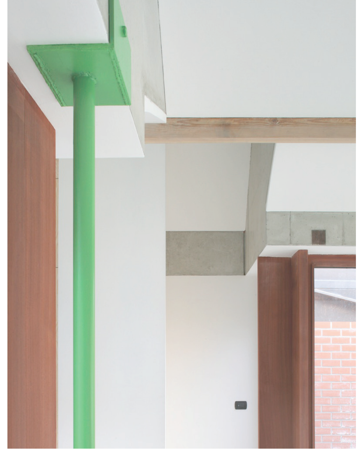
Detail House Scheeplos, de vylder vinck taillieu

The Summer Workshop is part of a research project in cooperation with SZS Stahlbau Zentrum Schweiz and is generously supported by the foundation of former HSZ-T Zurich.