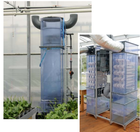
Figure 1: ZHAW and the project partner Watery test the absorption technology. Left: the absorber installed in the Swiss demonstrator at the greenhouse in Wangen for the air temperature and humidity control (ZHAW). Right: the absorption box of Watery is installed as air conditioner in a prototype building in Berlin.

The concentrated brine is then transported to the green house. The humid air is brought in contact to the concentrated brine which absorbs/desorbs the humidity. During the absorption process heat is released and the air temperature and humidity can be maintained at the required level setting the recirculation of the brine. Parallel to the climatisation through absorption, an innovative distribution system of conditioned air is developed and tested (fig. 2 and 3) allowing to treat only the air in contact to the crop instead the air of the entire green house.