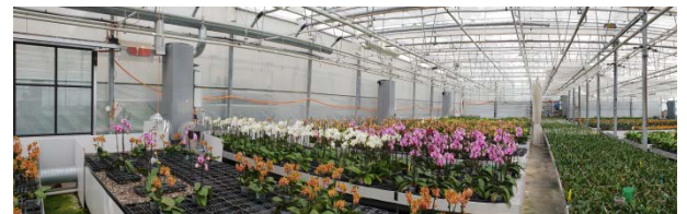
Figure 3: ZHAW test the technology under real conditions with the installation of nine absorbers in a 600m 2 greenhouse in Wangen by Dübendorf.

ZHAW School of Engineering Technikumstrasse 9 8401 Winterthur info.engineering@zhaw.ch www.engineering.zhaw.ch